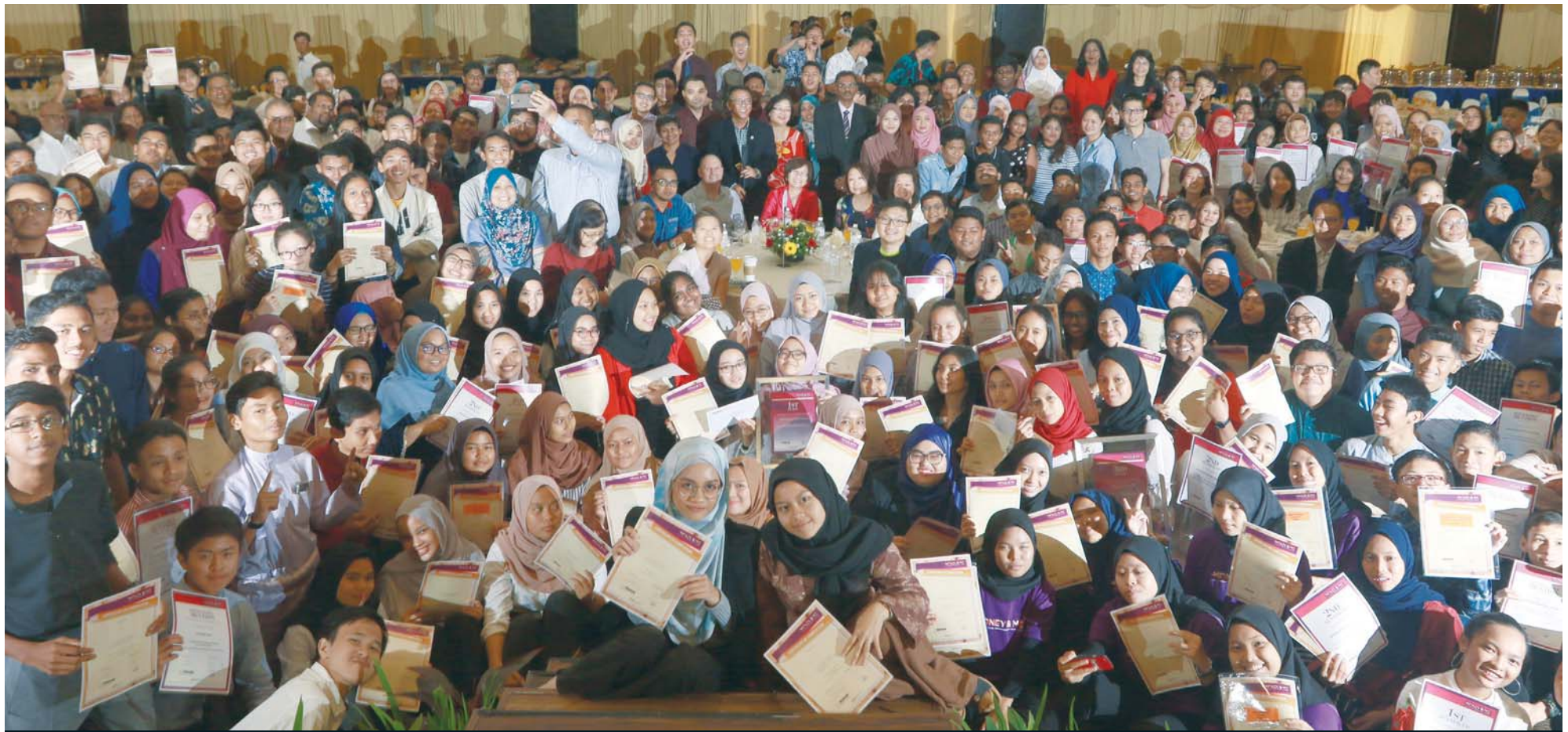
THE EDGE EDUCATION FOUNDATION'S MONEY & ME... 'Money & Me: Youth Financial Empowerment Programme' participants are seen here showing off their programme certificates at a prize-giving and appreciation ceremony in Subang Jaya, Selangor on Oct 13. Money & Me is a free financial literacy programme launched by The Edge Education Foundation and supported by Citi Foundation. It is approved as a co-curricular programme for Form Four students by the education ministry. The programme is carried out in schools with the help of volunteers and students from the following partners: BHP, Citi Malaysia, Deloitte, EY, GE, INTI International University and Colleges, KLK Oleo, Methodist College Kuala Lumpur, PwC, and the Rotary Clubs of Central Damansara and Sentul. This year about 340 students from 14 schools in Kuala Lumpur and Selangor took part in this six-month programme. Over 400 participants, teachers, volunteers and guests from partner organisations, the education ministry and the Selangor Education Department attended the event.